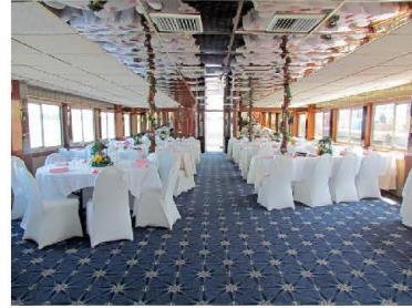
Lower Deck, Ben Franklin