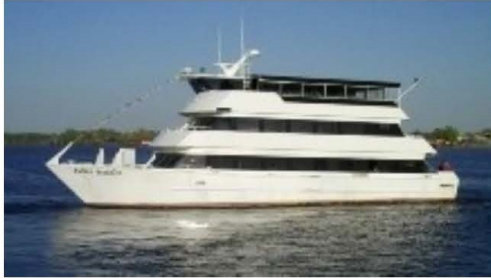
M/V Ben Franklin